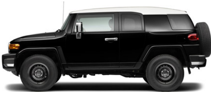
4x2 5-Speed Auto (4702) MSRP* Starting At: $21,710.00